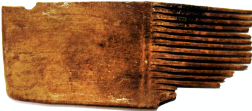
Fig. 1. Wooden comb excavated in the 'Cave of the Pool'