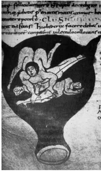
Soranus' Gynaecia, after Moshion Muscio circa 500 AD. Manuscript from about 900 AD.[43]

Soranova Gynaecia, prema Moshion Musciu, oko VI. stoljeća. Rukopis iz X. stoljeća.[43]