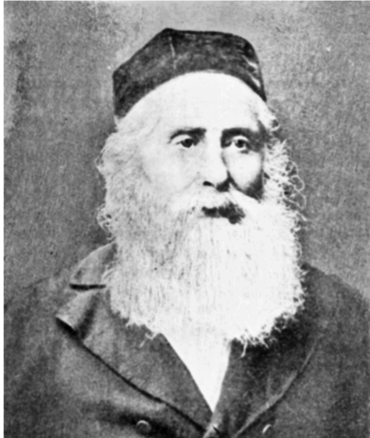
Figure 10.1 Hayyim Zelig Slonimski at age seventy-five. From The Jewish Encyclopedia , New York, Funk and Wagnalls, 1912.

a calculating machine that Stern had developed. Slonimski introduced some small improvements to the device, and after demonstrating it to the Imperial Academy of Sciences in St. Petersburg, he was awarded the Demidov Prize together with twenty-five hundred rubles. In 1845, the Russian minister of education made Slonimski an honorary citizen, a remarkable honor given that this time period, under the reign of Nicholas I (1825–1855), was a “somber chapter in the history of Russian Jewry, characterized by their suppression and coercion.” 46