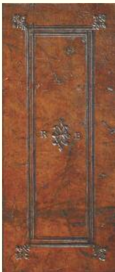
Previous page: The Westminster Abbey-Valmadonna set of the Bomberg Talmud.

A few individual tractates of the Talmud had been printed previously, but Bomberg was the first printer to take on the daunting task of issuing all sixty-three