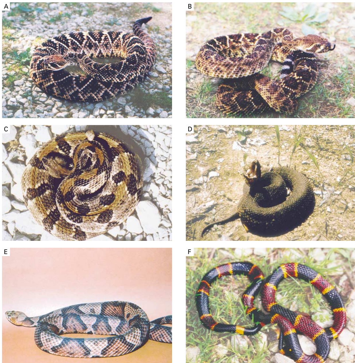
Figure 1. Venomous Snakes of North America.

Panel A shows an eastern diamondback rattlesnake ( Crotalus adamanteus ), Panel B a western diamondback rattlesnake ( C. atrox ), Panel C a timber rattlesnake ( C. horridus ), Panel D a cottonmouth ( Agkistrodon piscivorus ), Panel E a copperhead ( A. contortix ), and Panel F an eastern coral snake ( Micrurus fulvius fulvius ).